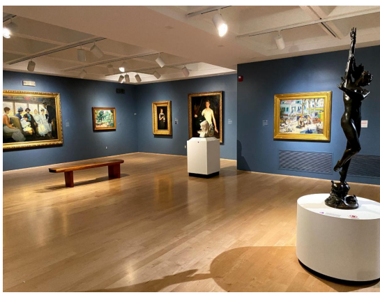
Installation View Impressionist Gallery

On the contemporary scene was Spring/Break's Heresy/Hearsay themed edition during Armory Week last September in NYC. I was selected from thousands of applicants to exhibit as an independent curator with a solo presentation titled "Horror Vacui," of the works of French artist Marguerite Wibaux. Her bold, figurative paintings echo the themes and composition of iconic artists and works of art, and drew a fantastic response from visitors to the Fair. Most pieces were grabbed up by savvy collectors and art dealers!