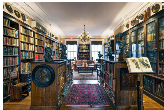
The Salmagundi Library