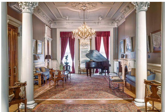
The Salmagundi Parlor Room