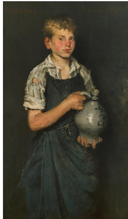
William Merritt Chase "The Apprentice"